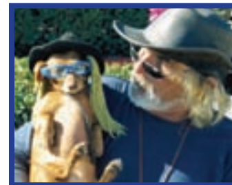
Even dogs wear sunglasses in California!