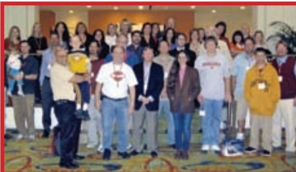
Factor Nine Family Meeting held in conjunction with the National Hemophilia Foundation's 61st Annual Meeting in San Francisco, California - October 31, 2009