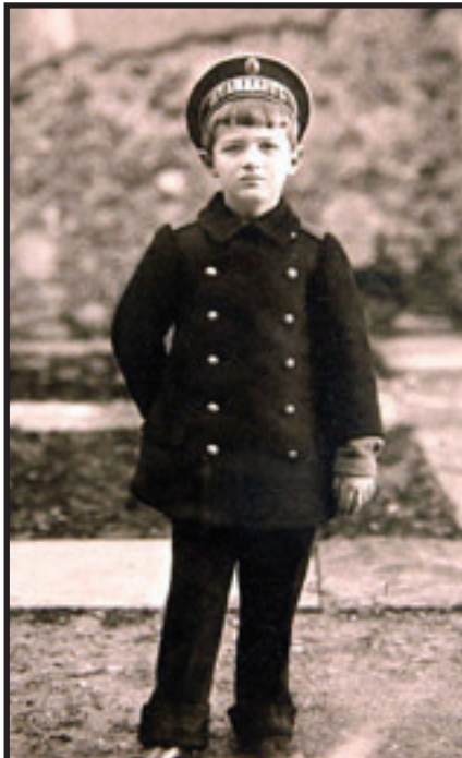
Royal affliction: Prince Alexei bled frequently and for prolonged periods.